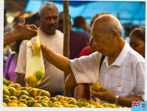
Pacific Network on Globalization, Fiji

After nine years of litigation and community struggle led by our movement partner Bufete de Pueblos Indígenas in Guatemala , the Indigenous Mayan Ixil community from the Ixil triangle of Nebaj, Quiché, recovered 1,500 caballerías of land (67,500 hectares or approximately 166,800 acres). The return of this land led to a cease in the construction of buildings as well as hydroelectric plants, which would have destroyed rich water reservoirs and had detrimental impacts on the environment and the way of living of Ixil communities.