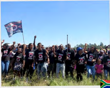
Amadiba Crisis Committee, South Africa

Climate justice activists in South Africa sailed into 2022 with a substantial win against the oil giant Shell. Shell's plans to begin exploring for oil and gas in the Indian Ocean off of KwaZulu-Natal's Wild Coast were halted after frontline coastal communities took the multinational corporation to the High Court, which sided with them in a landmark victory. This win was made possible by a coalition of organizations led by our movement partner Amadiba Crisis Committee .