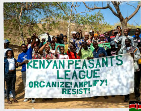
Kenyan Peasants League, Kenya

Nepal's government expanded community-managed forestry to cover 60% of all forest land by 2030 and simultaneously increased the number of Community Forest User Groups—autonomous local community institutions—from 638 to 22,519 (comprising 55% of the population). Federation of Community Forest Users in Nepal's work played an instrumental role in these achievements, which also included a call to support gender equity by appointing 22,000 women to community leadership roles.