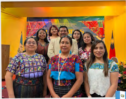
Bufete de Pueblos Indígenas, Guatemala

After nine years of litigation and community struggle led by our movement partner Bufete de Pueblos Indígenas in Guatemala , the Indigenous Mayan Ixil community from the Ixil triangle of Nebaj, Quiché, recovered 1,500 caballerías of land (67,500 hectares or approximately 166,800 acres). The return of this land led to a cease in the construction of buildings as well as hydroelectric plants, which would have destroyed rich water reservoirs and had detrimental impacts on the environment and the way of living of Ixil communities.