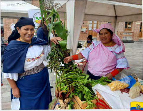
Comité Central de Mujeres de la Unión de Organizaciones Campesinas e Indígenas de Cotacachi, Ecuador

After years of hard work by Comité Central de Mujeres de la Unión de Organizaciones Campesinas e Indígenas de Cotacachi (CCMU-UNORCAC) in Ecuador , the Food and Agriculture Organization (FAO) recognized the Andean Chakra as an ancestral agroforestry system of the Kichwas communities in Cotacachi by certifying it as a Globally Important Agricultural Heritage Systems (GIAHS). Last year, over 300 participants took part in CCMU-UNORCAC's weekly workshops that promote women's expertise, center Indigenous peasant women's ancestry, and train attendees on agroecological practices for food production.