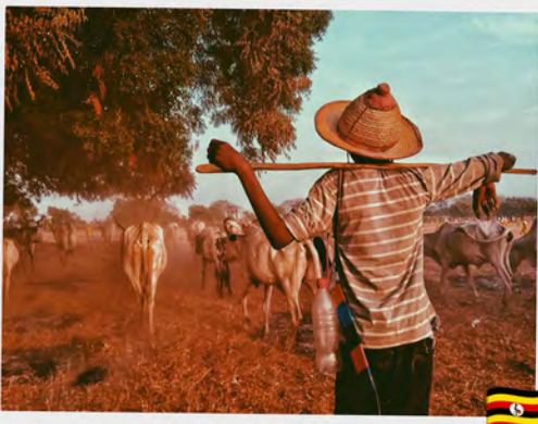
Witness Radio, Uganda

A five-year climate action lawsuit against the World Bank Group's International Finance Corporation (IFC), spearheaded by our movement partner Philippines Movement for Climate Justice , led to accountability mechanisms that will end coal investments by the IFC. The IFC will require that financial institutions in which it has equity begin phasing out coal sector financing immediately, and bring their coal exposure to zero by 2030.