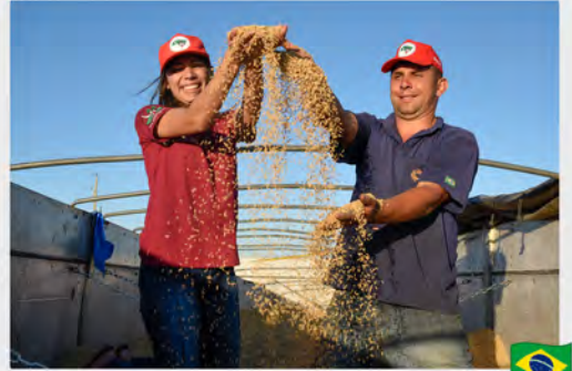
Movimento dos Trabalhadores Rurais Sem Terra, Brazil

Climate justice activists in South Africa sailed into 2022 with a substantial win against the oil giant Shell. Shell's plans to begin exploring for oil and gas in the Indian Ocean off of KwaZulu-Natal's Wild Coast were halted after frontline coastal communities took the multinational corporation to the High Court, which sided with them in a landmark victory. This win was made possible by a coalition of organizations led by our movement partner Amadiba Crisis Committee .