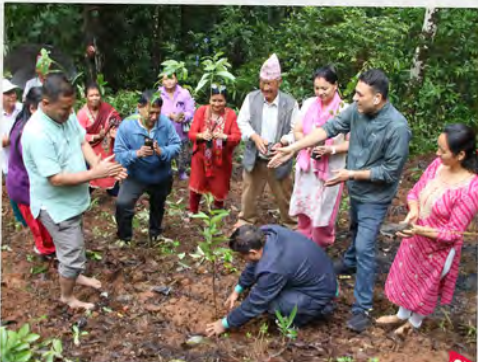
Federation of Community Forest Users, Nepal

This past year, Movimento dos Trabalhadores Rurais Sem Terra (MST), a movement in Brazil made up of 1.5 million rural, poor, and landless peasants fighting for agrarian reform, entered its 39th year . Their vast work expanded to 24 of Brazil's 27 states, representing five regions in the country. In reclaiming 17 million acres of land, more than 350,000 rural families and many more in surrounding urban communities have been fed—making MST the largest producer of organic rice in Brazil. In addition to contributing to communities' food needs, the rice is exported and sent to public schools so that young people have more access to organic food.