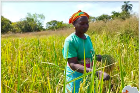
Nous Sommes la Solution, West Africa

Almost a decade after pioneering a global campaign against deep sea mining alongside other Pacific movements and civil society groups, the advocacy work of Pacific Network on Globalization , one of our Fiji -based partners, contributed to a significant victory when French president Emmanuel Macron announced at COP27 that he supported a ban on deep sea mining in international waters. This followed Germany's declaration of support for a precautionary pause on deep sea mining. The French parliament subsequently banned deep sea mining from French national waters, and the New Zealand government recently announced that it backs a conditional moratorium on deep sea mining in international waters.