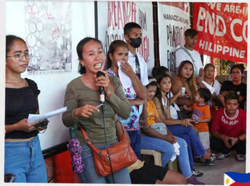
Philippines Movement for Climate Justice, Philippines

After years of hard work by Comité Central de Mujeres de la Unión de Organizaciones Campesinas e Indígenas de Cotacachi (CCMU-UNORCAC) in Ecuador , the Food and Agriculture Organization (FAO) recognized the Andean Chakra as an ancestral agroforestry system of the Kichwas communities in Cotacachi by certifying it as a Globally Important Agricultural Heritage Systems (GIAHS). Last year, over 300 participants took part in CCMU-UNORCAC's weekly workshops that promote women's expertise, center Indigenous peasant women's ancestry, and train attendees on agroecological practices for food production.